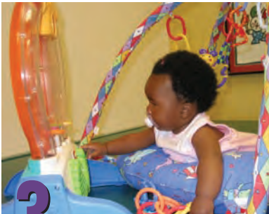
3 More Activities