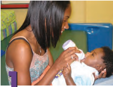
1 More Activities