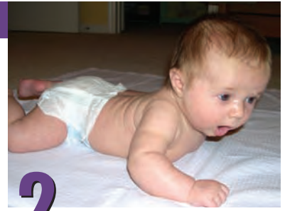
2 More Activities