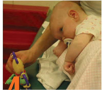
4 Positions for Play