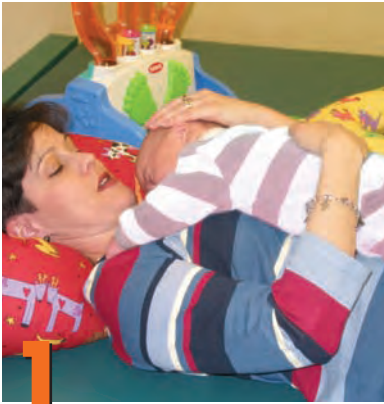
1 Positions for Play