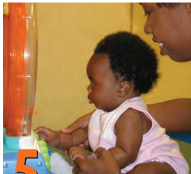
5 Positions for Play