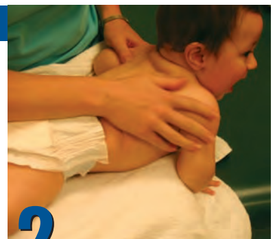
2 Dressing and Bathing