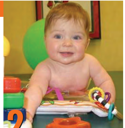
2 Positions for Play