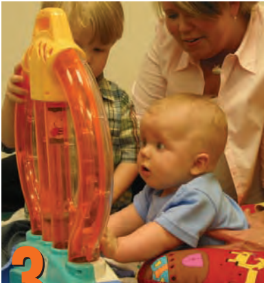
3 Positions for Play