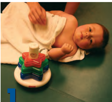
1 Dressing and Bathing