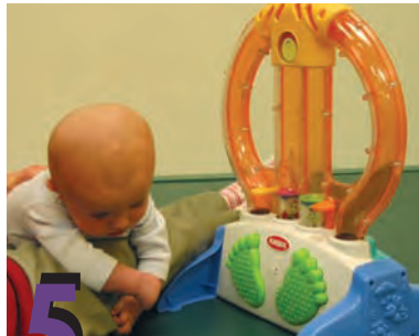
5 More Activities